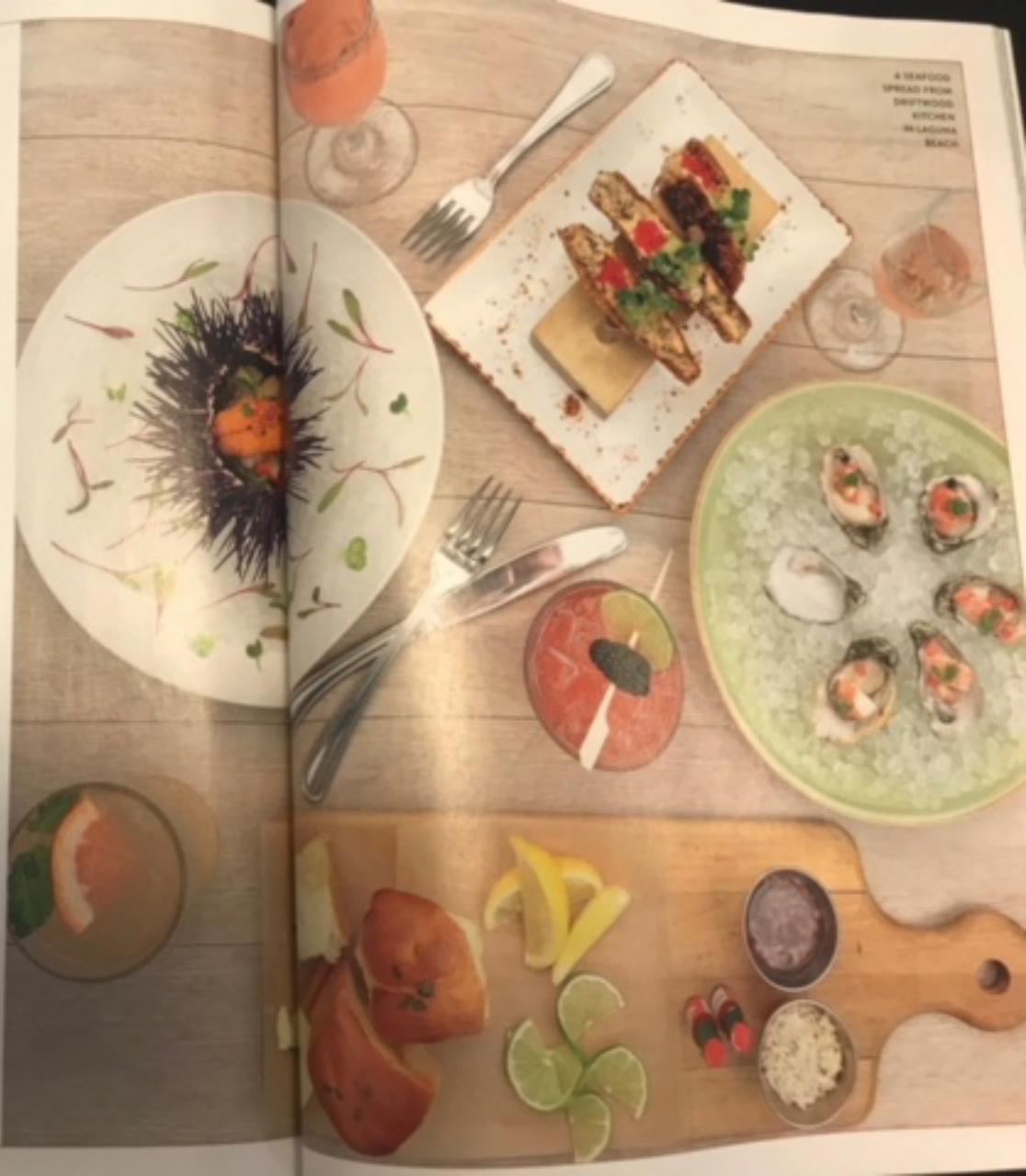
A SEAFOOD SPREAD FROM DREYFOSS STEAK WALADUNA BEACH